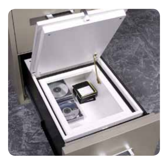
MI100 shown in a 2LGL-31 fire file