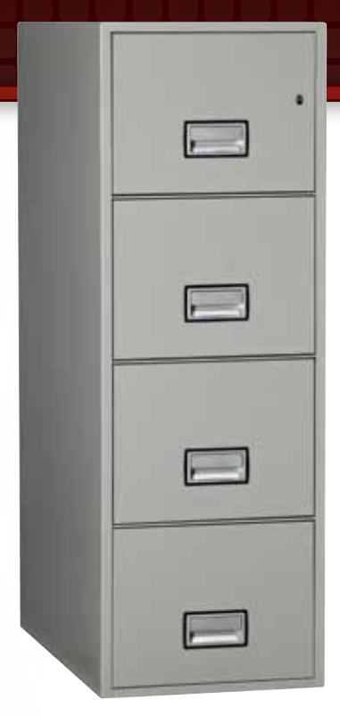
LGL4W25 Light Gray