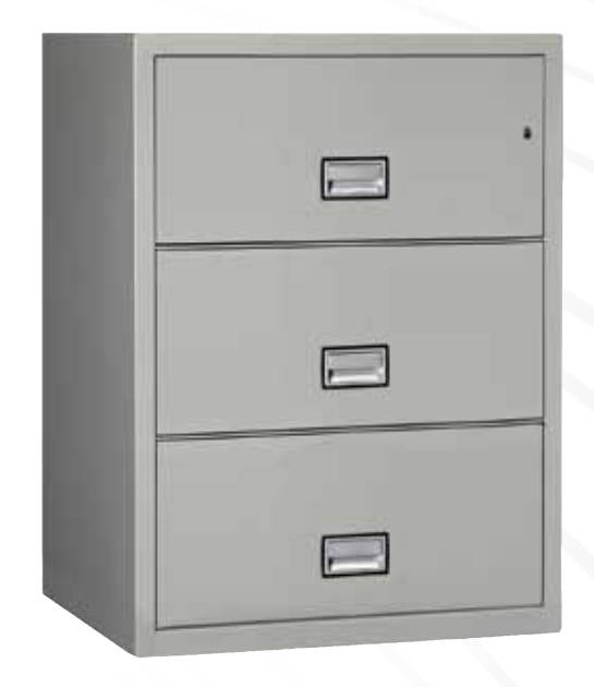
LAT3W31 Light Gray